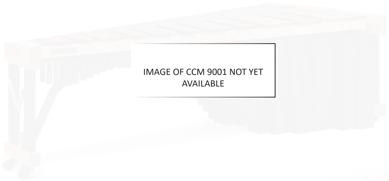
IMAGE OF CCM 9001 NOT YET AVAILABLE

CCM 9001 6.0 octave F1 - G7 Honduran Rosewood